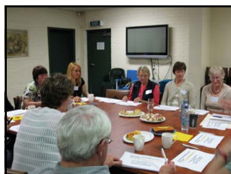
2008 Volunteer Training Session

Co-ordinator Volunteers (Centre & After Hours Telephone)