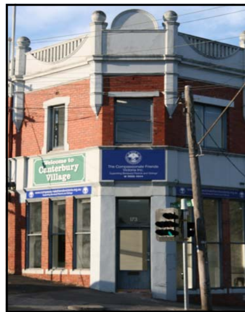
TCF New Home 173 Canterbury Road