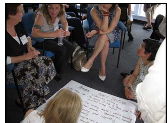
Stakeholders Future Workshop—Breakout Group Discussion