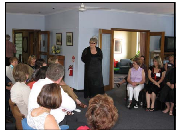
Stakeholders Future Workshop Group Discussion November 2008