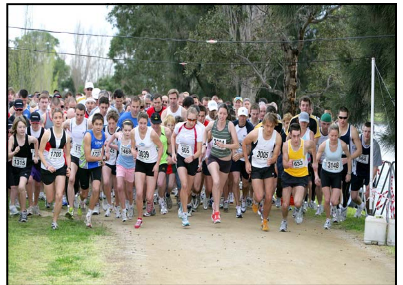
The "Runners" starting Albert Park Lake 24th August

The unwavering community spirit in which Defence and sponsors display makes this event so successful. Our heartfelt thanks to you all.