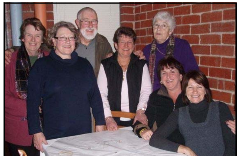
2008 Group Leader Training

Co-ordinator of Volunteers (Groups, Magazine, Library, Phone Friends)