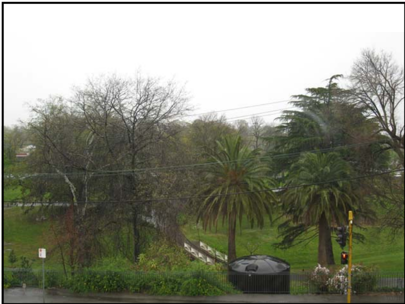
Canterbury Gardens—the view from TCF and access is outside the front door and across the road.