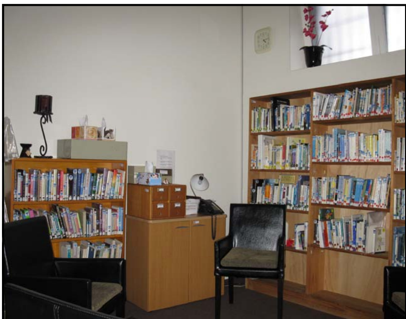
Our New Library