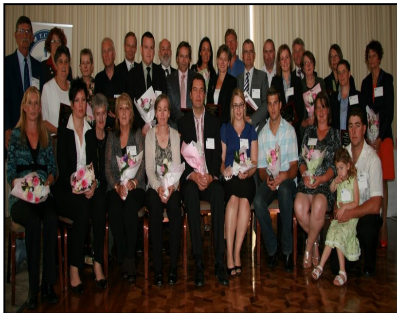
2009 Compassionate Employer Recognition Award Nominator and Recipients