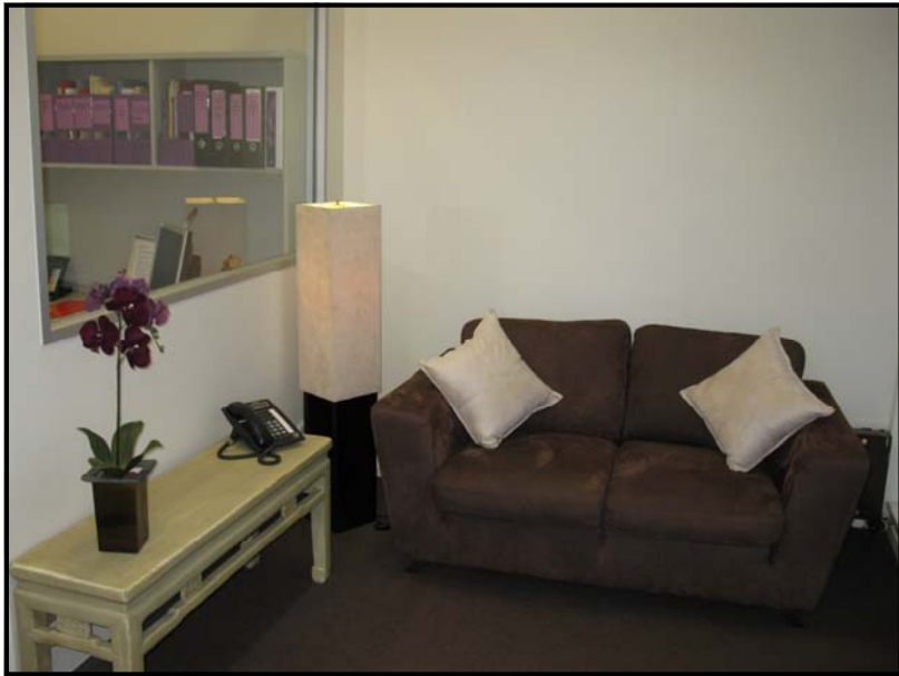
TCF Entrance Foyer

Welcome to 173 Canterbury Rd. On June 10 2009 TCF moved to our new premises on the Cnr of Canterbury and Balwyn Rds Canterbury. In searching for our new space it was important that we found a space that was welcoming, warm and safe for bereaved parents, siblings, grandparents, visitors, and that also reflects the a high level of professionalism of the organisation. We wanted excellent natural light, and access to an outdoor sanctuary. The pictures below give you a small visual look at our wonderful new home. I believe we have what we set out to find.